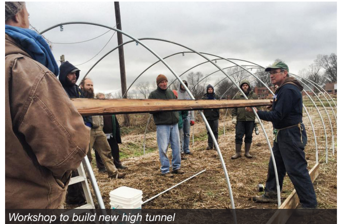
Workshop to build new high tunnel