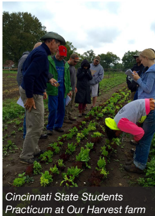
Cincinnati State Students Practicum at Our Harvest farm