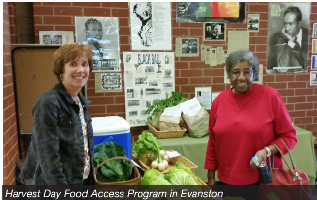
Harvest Day Food Access Program in Evanston