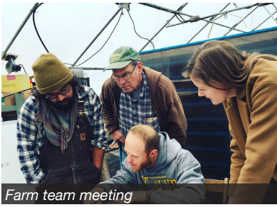
Farm team meeting