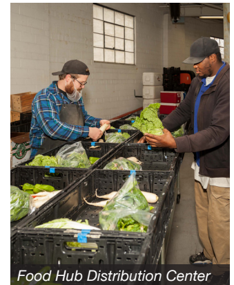
Food Hub Distribution Center