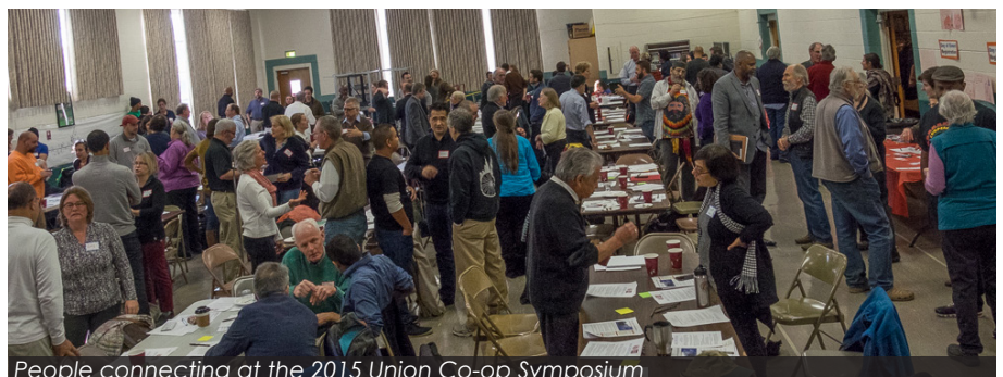
People connecting at the 2015 Union Co-op Symposium

1worker1vote.org and Mondragon International North America are building a national network of unionized worker-owned cooperative businesses to overcome inequality of opportunity, mobility, and income.