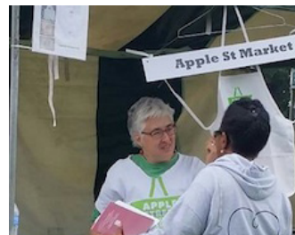
Apple St Market