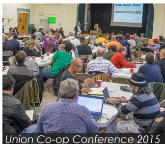
Union Co-op Conference 2015