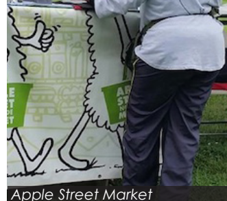
Apple Street Market

"It is time for us to take the initiative, to be part of the solution and to embrace a successful economic development model that creates jobs and is accountable to workers, their families and their communities for the long-term."