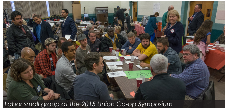
Labor small group at the 2015 Union Co-op Symposium

The Union Co-op Symposium was a huge success, allowing over 150 people from across the country to come together to strengthen the union co-op movement. Representatives from Mondragon provided us with valuable insight into starting and financing a network of cooperatives. A new National Union Co-op Manufacturing Committee was born out of the symposium, which is laying the groundwork for the development of a new generation of manufacturing co-ops.