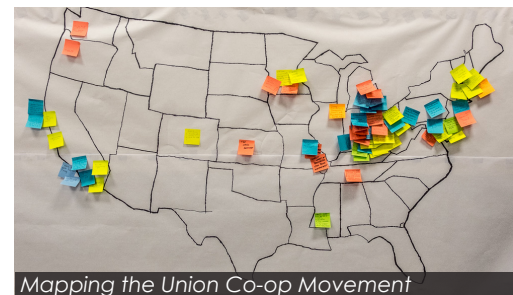
Mapping the Union Co-op Movement

After attending CUCI's 2013 Union Co-op Symposium, a group of union members and business owners from Los Angeles incorporated as the LA Union Co-op Initiative. Our 2015 Symposium bolstered regional efforts in various places. Closer to Cincinnati, a group of labor and community organizers in Dayton reached out to CUCI looking for solutions to their city's hunger crisis. Their leading initiative is a worker and community-owned grocery store modeled after CUCI's Apple Street Market. The Dayton initiative is also collaborating with CUCI on a manufacturing conversion program for Southwest Ohio.