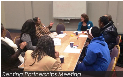
Renting Partnerships Meeting